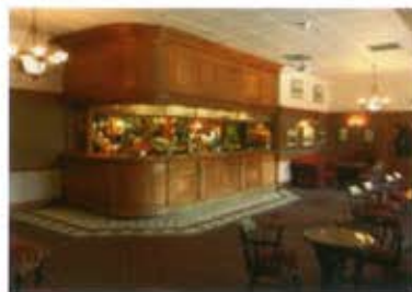
Three Counties Hotel, Hereford for the 2015 Convention