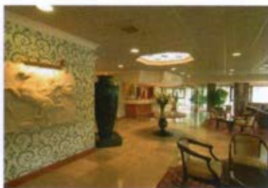
Three Counties Hotel, interior views

Creating a good sound to make harmony with your heart.