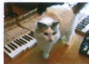
The cat is Mr Ming. The dog is my apprentice, Charlie.

Little furry friends of the Piano Fairy are often around me during my service. They are very happy to see me and often just wait beside the piano to enjoy the sound. Do you know why? The sound is vibration and energy. The Piano Fairy told me that animals are very pure beings so that they naturally recognize pure energy and a good sound. The clear and good sound also affects the flow of energy in the room, and it will purify the room and reduce the energy level, as well as giving a healing environment to all of us which is beneficial. I think this is one of the reasons why acoustic musical instruments continue to be loved by many people for more than 200 years. I enjoy taking photos of pets with the piano very much.